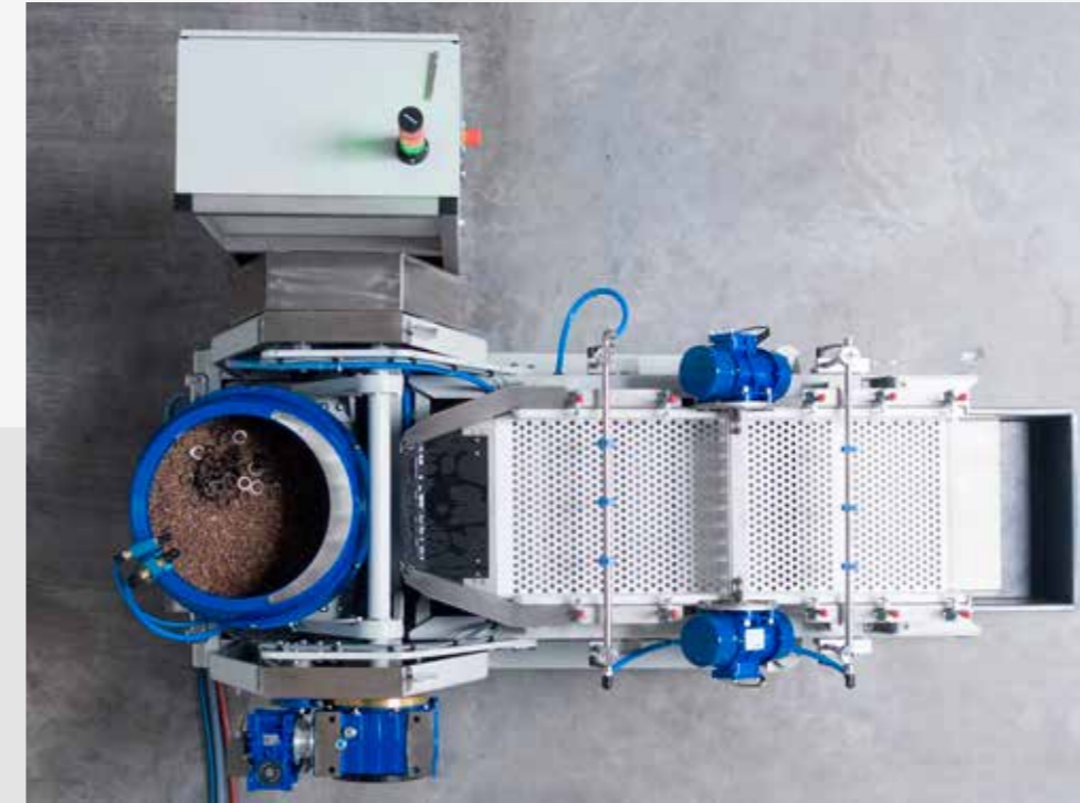
TE 60 R 1-batchsystem with separationunit and integrated media return - the compact solution