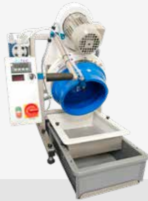
TE 6 HD